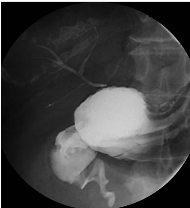
Fig. 2 Opacification of the whole biliary tree via a choledochogastrostomy after ingestion of water-soluble contrast medium.

4th Department of Internal Medicine, Wilhelminenspital, Vienna, Austria