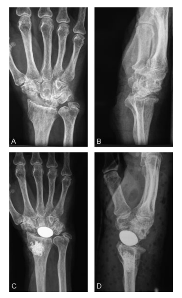
Figure 2 Scaphoid silicon implant failure after 15 years in the left wrist of a 71-year-old lady. (A, B) preoperative X-rays. (C, D) postoperative X-rays at 3-year follow-up. Carpal bone cysts have been filled with cancellous bone graft from the radius. Range of motion was 60 degrees in flexion extension and 40 degrees in ulnoradial inclination. Grip strength was 88% to the contralateral side, PRWE score was 3 of 100, QuickDASH score was 9.09 of100, and the patient was very satisfied. PRWE, Patient-Rated Wrist Evaluation; DASH, Disability Arm Shoulder and Hand.

Pain was rated on a pain scale between 0 and 10 by extracting the pain score from the Visual Analog Scale pain scale of the PRWE questionnaire (of 50 points).