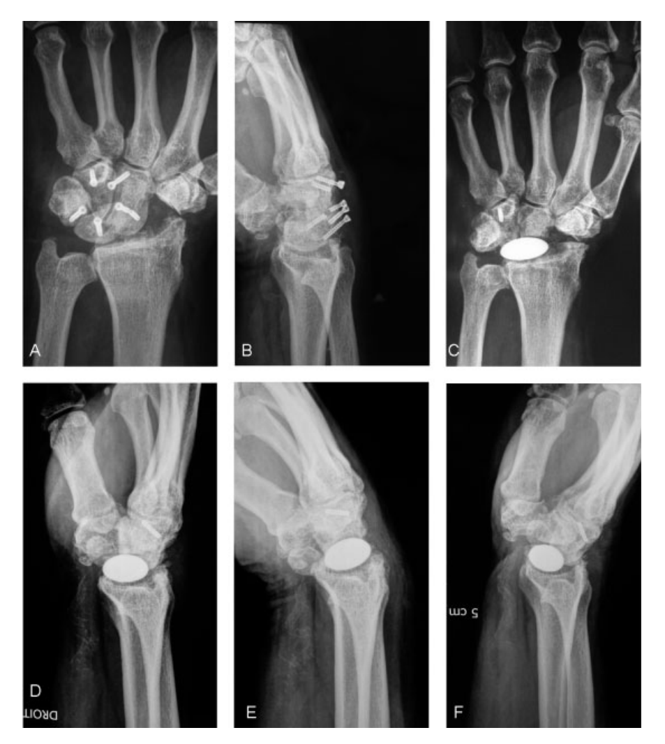
Figure 1 Four-bone fusion failure in the right wrist of a 66-year-old man. (A, B) preoperative X-rays. (C–F) postoperative standard and dynamic X-rays at 1-year follow-up.

were repaired. A redundant volar was plicated with nonabsorbable sutures. Any large bone cavities in the radius or the carpus were curetted and bone grafted.