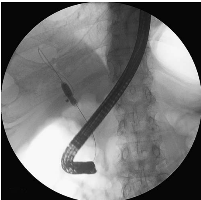
Fig. 3 Radiograph showing the biliary stenosis dilated by a balloon dilator.