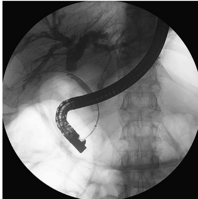
Fig. 1 Radiograph showing the tight and eccentric stricture and the guide wire in the cystic duct.

ERCP-guided cholangioscopy with SDVS allows direct visualization of the bile ducts, tissue sampling, and therapeutic maneuvers [1–3]. Tight and eccentric strictures are a common cause of unsuccessful cannulation and ERCP failure. In such cases a second ERCP is usually attempted and, if unsuccessful, a percutaneous approach or revision surgery is usually employed. To the best of our knowledge this is one of the very few reported cases of the use of SDVS for cholangioscopic placement of a guide wire across a difficult stricture. The first reported case concerned an anastomotic stric-