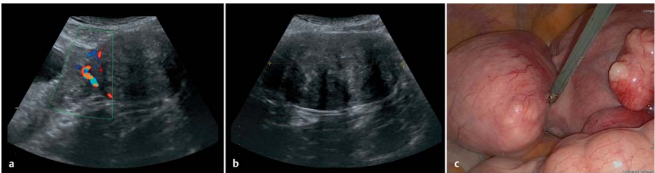
Fig. 3 a to c Case 7 (see Table 2 ): a ultrasound view of source of blood flow to the leiomyoma; b ultrasound view of the uterine mass; c laparoscopic exposure of the leiomyoma stalk.