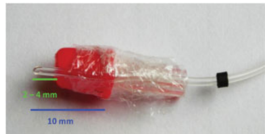
Figure 2 Example of simultaneous probe-tube insertion strategy for use with infants. Insertion depth guidelines are also provided if the clinician chooses to insert the probe-tube independently from the ear tip.

For an accurate RECD measurement in young infants, the probe tube was noted to be extended beyond the ear tip by \sim 2 to 4 mm.