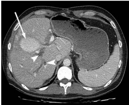
Fig. 1 Computed tomography performed on the day after endoscopic retrograde cholangiography, showing contrast-enhanced biloma (arrow) and dilated intrahepatic bile ducts (arrowheads).

A 54-year-old man presented with jaundice and an elevated serum bilirubin level of 11.86 mg/dL after radiofrequency ablation of hepatic metastases from rectal carcinoma. A high-grade stenosis at the common bile duct (CBD) was diagnosed on endoscopic retrograde cholangiography (ERC), and computed tomography showed a 7-cm intrahepatic biloma compressing the CBD (Fig. 1). A subsequent attempt to bypass the biloma by percutaneous transhepatic biliary drainage (PTBD) failed because the exit of the biloma could not be probed. A pigtail catheter was placed to drain the biloma externally (Fig. 2, Fig. 3).