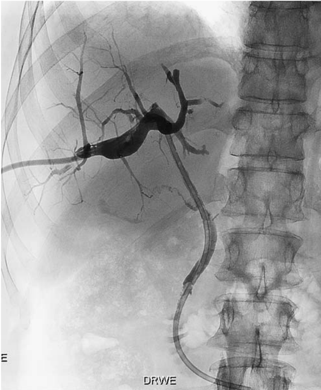
Fig. 6 After temporary placement of an 8.3-Fr pigtail catheter, a 12-Fr Munich percutaneous drainage catheter (Peter Pflugbeil GmbH, Zorneding, Germany) finally crosses the duct necrosis. The bile drains into the duodenum. The external end of the Munich catheter is capped.