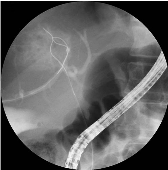
Fig. 4 Rendezvous: the gooseneck snare catches the endoscopic retrograde cholangiography guide wire.