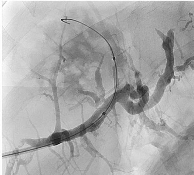
Fig. 2 Percutaneous transhepatic cholangiography guide wire placed in the biloma.

In a second procedure the patient underwent ERC and PTBD simultaneously. The biloma was successfully probed by ERC with a guide wire, which was caught and extracted with a gooseneck snare via the PTBD access (Fig. 4) to achieve a pathway through the biloma (Fig. 5). A pigtail catheter was positioned with its tip lying in the duodenum and its side holes in the bile duct peripheral to the biloma. The regression of the patient's serum bilirubin concentration to 0.91 mg/dL and complete occlusion of the biloma 6 months after the procedure showed this treatment strategy to have been successful (Fig. 6). The principle of healing a bile duct leak is to generate a low-pressure system along the biliary tract by means of internal or external drainage [1–4]. Sciumè et al. [5] described a technique employing “rendezvous” between ERC and PTBD in high-grade stenosis of bile ducts.