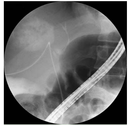
Fig. 5 The pull-through guide wire provides a percutaneous pathway from the peripheral bile duct to the common bile duct and on into the duodenum.