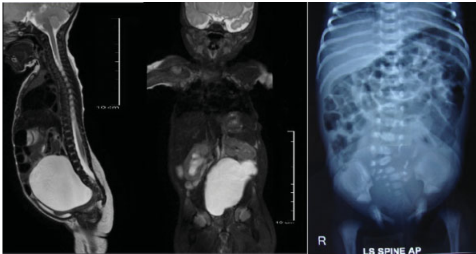
Fig. 1 Magnetic resonance imaging demonstrated a large cystic presacral mass without any intraspinal extension.

skin, a sacral pit, and tuft of hair below the swelling. In addition the child had a tense cystic lump occupying almost the entire abdomen, predominantly the left lumbar, left hypochondrium, left iliac fossa, umbilical, and hypogastric region and extending onto the right side. On per rectal examination the sacrum was free and the mass was palpated anterolateral to the rectum. Bilateral lower limb movements and anal tone were normal. The X-ray of the spine revealed hemivertebrae of L5/S1 vertebrae. The ultrasound detected a cystic presacral mass. The magnetic resonance imaging (MRI) for the abdomen, pelvis, and spine was done and revealed an 8 \times 6 \times 4 cm cystic mass arising from the presacral region, reaching very close to the sacral promontory but the dural sac was found to be intact. The mass had pushed the bowel loops and the sigmoid colon to the right and it was pushing on the inferior pole of the left kidney, thereby altering its position into a transverse one ( Fig. 1 ). The serum \alpha -feto protein was 3,574 ng/dL, which was normal for her age. With the differential diagnosis of an ovarian cyst or benign cystic retroperitoneal teratoma, the child was posted for laparoscopic excision of the cyst.