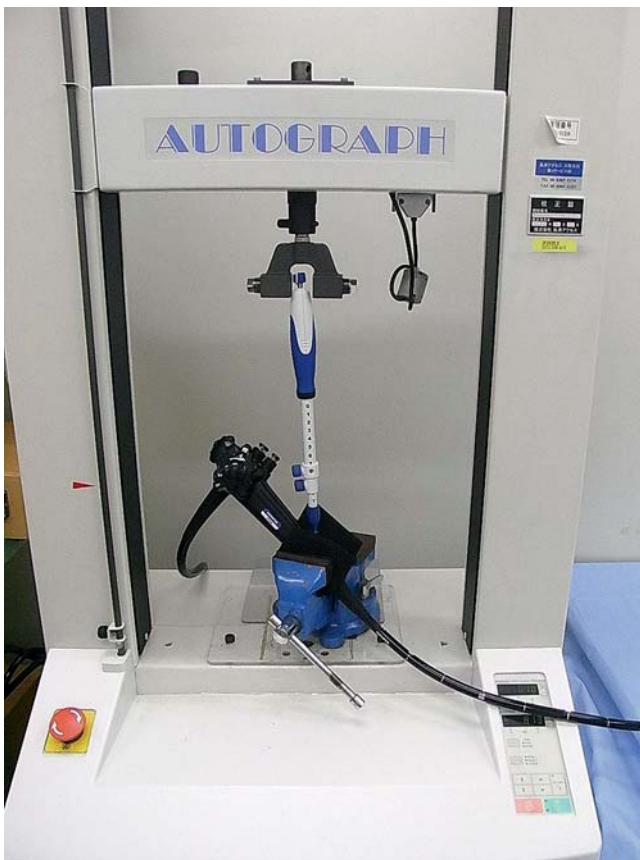
Fig. 3 Autograph equipment for examination of resistance to needle insertion.

geted lesions depends on both the flexibility of the scope and the direction of the ultrasound probe. The direction of the ultrasound probe differs between the Pentax and Olympus echoendoscopes, which have a side and an oblique direction, respectively, for the ultrasound beam direction. Therefore, the actual differentiation between the standard Pentax and Olympus scopes may be unclear because we did not image any real lesions by means of EUS with a 19G needle. The diagnostic slim Pentax echoendoscope (EG-3270UK) showed comparatively lower scope angulations than others. These data suggest that the standard large-diameter EUS scope has a robust wire that enables the large tip of the endoscope to be safely bent, while the diagnostic slim echoendoscope does not have a such a robust wire. That may lead to lower angulations when the 19-gauge needle is used. Since the needle angulation (angle B) is the most important parameter for various interventional EUS procedures, the Pentax slim echoendoscope in combination with a 19-gauge needle seems to be suboptimal for interventional EUS.