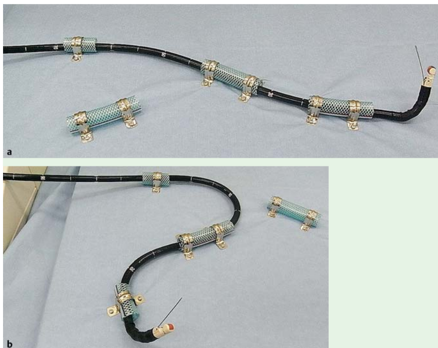
Fig. 1 Bench simulator: a straight therapeutic scope position; b curved scope position.