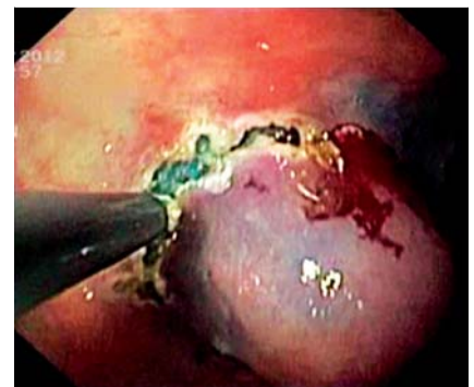
Fig. 1 Endoscopic submucosal dissection of a gastrointestinal stromal tumor with a hook knife.

DOI http://dx.doi.org/10.1055/s-0034-1365814 Endoscopy 2014; 46: E349 © Georg Thieme Verlag KG Stuttgart · New York ISSN 0013-726X