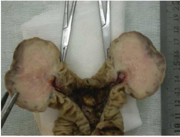
Fig. 1 Macroscopic view of polypoid mass emanating from bowel wall. The surface seems ulcerated and cut surface exhibits solid, white, fibrous texture.

anaplastic lymphoma kinase (ALK) (– Fig. 3 ). Tumor cells were negative for CD34. Evaluation of mass revealed IMT of colon.