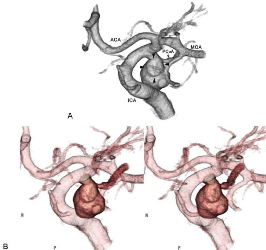
Fig. 1 (A) Volume rendering images of three-dimensional digital subtraction angiography demonstrated a bulging part on the surface of the dome of the left internal carotid-posterior communicating artery aneurysm (arrowheads). ACA, anterior cerebral artery; ICA, internal carotid artery; MCA, middle cerebral artery; PCoA, posterior communicating artery. (B) Stereogram for cross viewing.

originated from the aneurysm neck. It was revealed that the aneurysm dome split the oculomotor nerve. On the surface of the aneurysm dome, a bulging part surrounded by a fenestrated oculomotor nerve and the cerebellar tentorium was noted (► Fig. 2 ). After the fenestrated oculomotor nerve was dissected from the bulging part with a careful microsurgical technique, neck clipping was performed using two clips (► Fig. 3 ). After neck clipping, blood flow to the posterior communicating artery was confirmed by Doppler ultrasonography. The post-