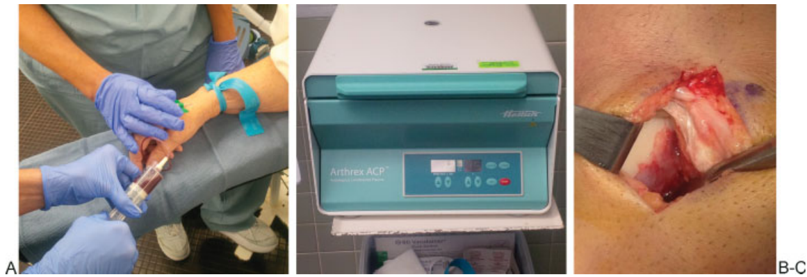
Fig. 2 (A) A blood draw is performed on the patient intraoperatively after the induction of anesthesia. (B) The blood is spun down in a centrifuge to separate out the platelet-rich plasma. (C) The platelet-rich plasma is placed at the microfracture site with a fibrin glue sealant.

uses for PRP continue to be studied with higher levels of evidence, with the hope that more definitive conclusions can be made either in favor of or against routine use in the orthopedics.