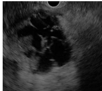
Fig. 4 Endoscopic ultrasound (EUS) revealed a 5-cm complex septated cystic lesion located near the head of the pancreas and abutting the inferior vena cava.

A 32-year-old woman presented with a dull aching abdominal pain of 2 months duration. She had similar complaints 18 months earlier and on evaluation, she was found to have a 4-cm cystic lesion near the head of the pancreas (● Fig. 1). A