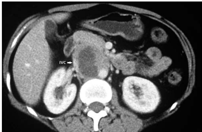
Fig. 2 A repeat contrast enhanced CT abdominal scan showed a complex thick-walled cystic lesion measuring ~5 cm in size, located near the head of the pancreas and invading the medial wall of the inferior vena cava (IVC).