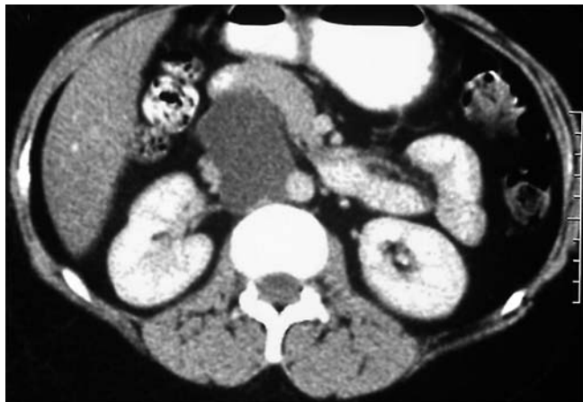
Fig. 1 A 32-year-old woman presented with a dull aching abdominal pain of 2 months duration. A computed tomography (CT) abdominal scan revealed a 4-cm cystic lesion near the head of the pancreas.