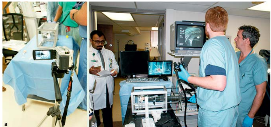
Fig. 3 a, b The endoscopists are filmed, observed, and guided by two experts in endoscopic retrograde cholangiopancreatography.