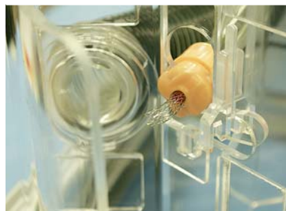
Fig. 4 Deployed metal stent. An advantage of this model is that it is possible to remove the stent and reuse the papilla several times to practice stent placement and other therapeutic interventions.