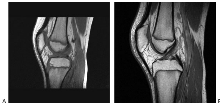
Fig. 1 (A, B) Respectively proton density and T2-weighted magnetic resonance imaging of the right knee at the age of 8 years, showed normal menisci, but a midsubstance anterior cruciate ligament rupture.

Few authors have described ACL regeneration with conservative treatment. Fujimoto et al concluded that patients with low athletic demands and sedentary occupation, with an intraligamentary ACL lesion but with continuity on MRI, could be treated successfully with an extension block soft brace. 6 Malanga et al showed that tear location might