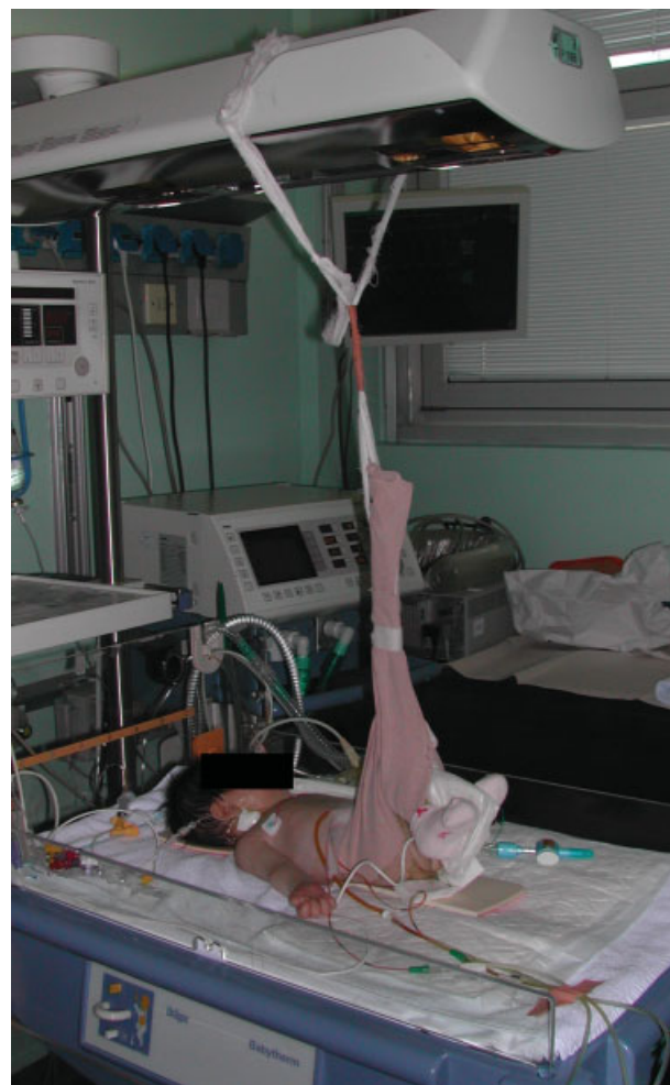
Fig. 2 Postoperative patient immobilization with pelvis and lower limbs wrapped around and suspended in a special hammock device (modified Bryant traction).

The overall incidence of EEC has been estimated by Nelson et al 5 in 2.15 per 100,000 live births, with an even male-to-female ratio (odds ratio, 0.989; 95% confidence interval 0.88–1.12), and a significantly increased incidence in white compared with nonwhite neonates (incidence, 2.63 vs. 1.54 per 100,000; p < 0.0001 ). Classic bladder exstrophy occurs in 1:10,000 to 1:50,000 live births 6 ; epispadias is estimated to