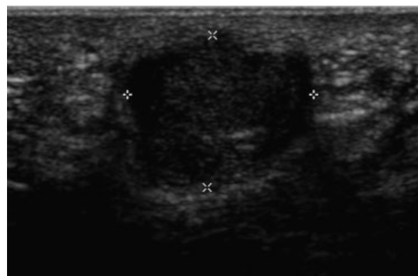
Fig. 2 Ultrasonography showing a round, well-demarcated, irregular echogenic mass under the dermis.

bilateral median neuropathies at the wrist with more severe involvement of the left side. We performed mini-open carpal tunnel release on the left side as usual, and the surgical wound was closed with vertical mattress sutures of 3-0 nylon. The postoperative course was uneventful, and the patient stopped follow-up visits with complete resolution of his symptoms 4 months after the surgery. However, 20 months after surgery, he revisited with complaints of a palpable mass at the previous operation site and a tingling sensation in the medial nerve distribution. The mass grew insidiously, and he denied any traumatic episode involving the left hand or wrist after the previous operation. Physical examination revealed a mass beneath the previous operation scar (→ Fig. 1 ). The mass was palpable and firm without signs of infection and had a positive Tinel sign. Ultrasonography demonstrated a 1.0 × 0.8-cm round, well-demarcated, irregular echogenic soft tissue mass under the dermis (→ Fig. 2 ).