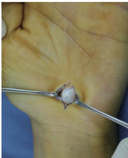
Fig. 3 Intraoperative photographs showing a well-demarcated, round whitish yellow mass.

We decided to perform surgical exploration and made a 2-cm skin incision along the previous operation scar. A shiny, white, well-demarcated round mass was found in the subcutaneous tissue layer (→ Fig. 3 ). The mass was easily pulled out. The wound was copiously irrigated and then closed with vertical mattress sutures of 3-0 nylon. Histological examination