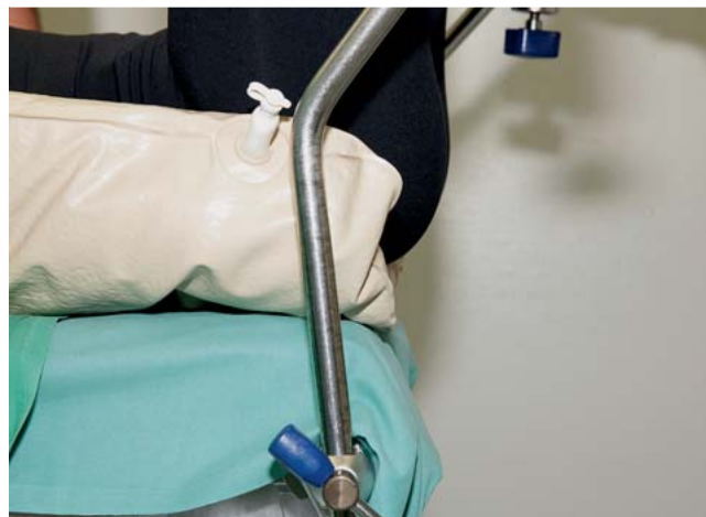
Fig. 7 Prevention of neuropathies of the lower extremity (3): ensure optimal positioning of the sacrum in the lithotomy position.

tive positioning-related obturator neuropathy after cesarean section.