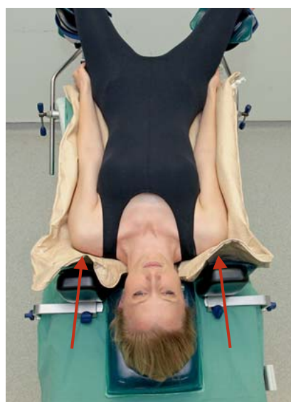
Fig. 4 Prevention of neuropathies of the upper extremities (4): aspects of the Trendelenburg position and of the use of shoulder braces to prevent brachial plexus neuropathies.

Obturator neuropathy: The obturator nerve is a nerve of the lumbar plexus. There are few reports on obturator neuropathy after procedures in the lithotomy position [69]. Experiments have shown that abduction of the thigh between 30\text{--}45^\circ in the hip joint results in significant traction of the obturator nerve which can be compensated for by hip flexion [70]. Obturator nerve injury caused by pressure of the fetus on the internal pelvic wall have been described after vaginal delivery [71]. This phenomenon must also be considered in the differential diagnosis of puta-