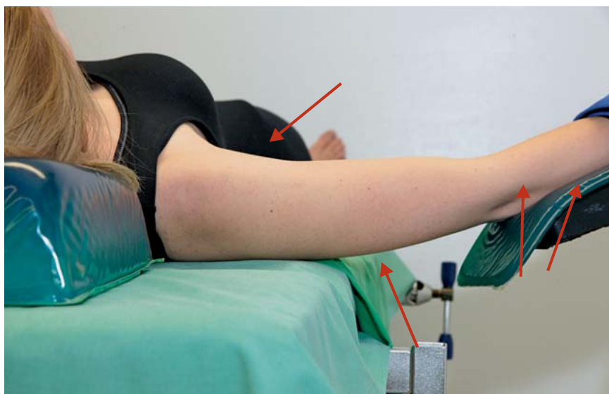
Fig. 1 Prevention of neuropathies of the upper extremities (1); optimize positioning of the shoulder to prevent brachial plexus injury or ulnar neuropathy.