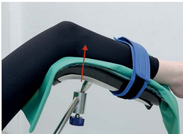
Fig. 6 Prevention of neuropathies of the lower extremity (2): place the lower leg in padded stirrups.