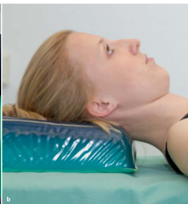
Fig. 2 a and b Prevention of neuropathies of the upper extremities (2): positioning of the head and abduction of the arm.

muscles required to lift the foot at the ankle and the arch of the foot and provides sensory information for the web space between the first and second toe. Because of the limited soft tissue cushioning at the fibular neck there is a risk of direct pressure injury. Pressure is often caused by unpadded contact with the leg holder. Alternatively, a combination of hip flexion and knee extension can lead to non-physiological traction of the sciatic nerve and the peroneal nerves [53]. Postoperative symptoms of common peroneal neuropathy include sensory deficits in the lateral lower leg and of the arch of the foot. Injury can result in motor deficits affecting the dorsal flexion of the foot, which may present clinically as drop foot. The differential diagnosis should include peroneal/sciatic injury and injury of a branch of the lumbosacral