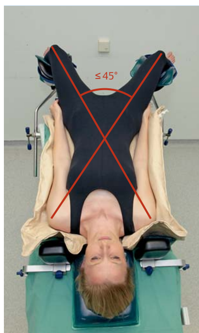
Fig. 5 Prevention of neuropathies of the lower extremity (1): ensure correct leg abduction to prevent traction of the obturator nerve.