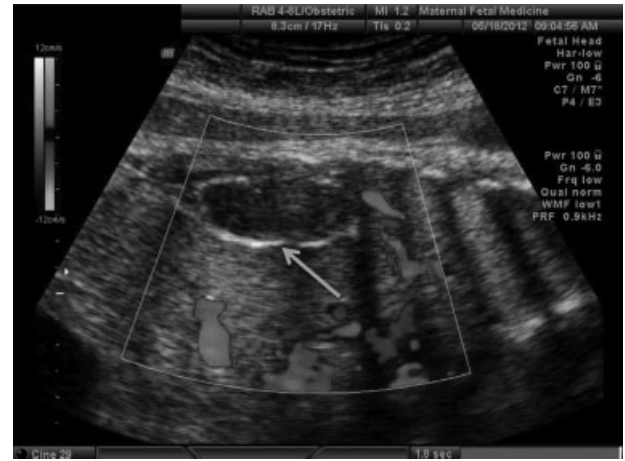
Fig. 3 Sagittal cyst at 35 weeks with color flow. The arrow points to the edge of the subcapsular liver hematoma (SCH) on the image.

causes of fetal cystic hepatic mass include gallbladder duplication, choledochal cysts, nonbile-containing intrahepatic cyst, mesenchymal hamartoma of the liver, ciliated hepatic foregut cyst, and congenital hepatoblastoma. 1-9