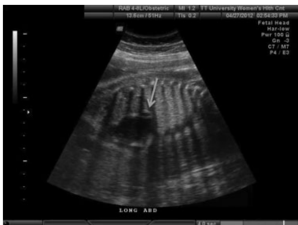
Fig. 2 Sagittal view of cyst at 32 weeks. The arrow points to the edge of the subcapsular liver hematoma (SCH) on the image.

The case presented a diagnostic dilemma. The mass was not associated with bowel dilation, hyperperistalsis, free fluid, or signs suggestive of fetal infection or meconium peritonitis. This mass moved with the liver during fetal respiration and appeared to indent the liver parenchyma. Previously reported