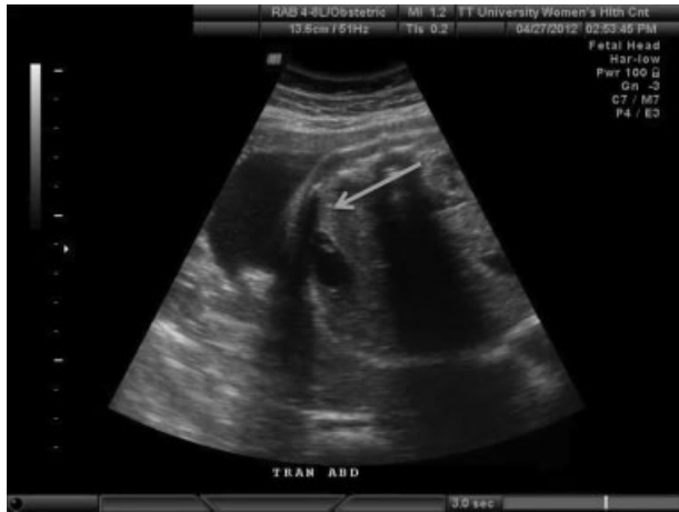
Fig. 1 Transverse fetal abdomen at 32 weeks. The arrow points to the edge of the subcapsular liver hematoma (SCH) on the image.

Doppler evaluation of these areas did not demonstrate high-velocity vascular flow within either lesion (→ Fig. 4 ). The baby had an unremarkable neonatal course and was discharged home for scheduled follow-up with pediatrician.