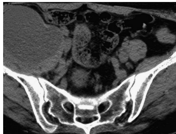
Fig. 2 Computed tomography revealed a giant cold abscess on the right iliac fossa.

Tuberculosis of the spine can cause serious morbidity, such as permanent neurologic deficits and severe deformity.