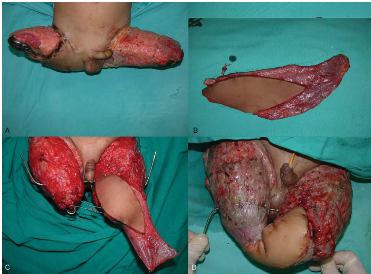
Fig. 3 (A) Preoperative appearance of the bilateral amputation stump. (B) Latissimus dorsi flap, intraoperative appearance. (C) Appearance of the latissimus dorsi flap after vascular anastomosis. (D) Immediate postoperative appearance.

neovascularization develops from these flaps in the long term, even if the dominant artery of the limb is not present. 27 As the cross-leg free flap is regarded as one of the last reconstruction options, everything possible for successful anastomosis should be performed in a seriously injured leg. However, end-to-side anastomosis may harm the vascularization of the damaged leg, and the posterior tibial vessels of the contralateral leg were prepared as recipient vessels for all our patients. We elected to use posterior tibial end-to-end anastomosis in our cases due to ease of positioning and anastomosis safety. Although using vessels from the healthy leg might be perceived as a disadvantage in the first stage, saving a lower extremity that could not be repaired by any other method of reconstruction represents the major advantage of the technique. Two pairs of major arteries and veins provide circulation in the leg, and when one of these is used, the other major artery and collaterals provide sufficient blood circulation to that limb. 20 The cross-leg free flap is therefore a safe option for both transported free tissue and the donor leg.