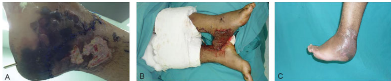
Fig. 1 (A) Preoperative appearance of a necrotic region in the left heel. (B) Early postoperative appearance of the gracilis muscle cross-leg free flap. (C) Postoperative sixth month appearance.

A 7-year-old boy was referred to the emergency department following a traffic accident. The bilateral legs were amputated from the distal part of the femur, and the proximal part of the right femur was broken. The right femur was fixed with plates, and avulsed skin parts were excised due to insufficient skin circulation. Wound care was performed for 10 days. At the end of 10 days, the bilateral distal parts of the femur and plates were exposed (►Fig. 3A). The distal part of the left femoral vessels was prepared for anastomosis with the