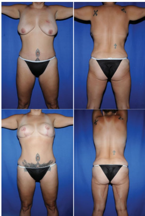
Fig. 1 Preoperative appearance of a 42-year-old female patient with unilateral multifocal ductal carcinoma in situ (upper left and right) that underwent bilateral mastectomies and immediate autologous breast reconstruction using a fleur-de-lis modification of the profunda artery perforator flap. After 6 months of the initial operation the patient underwent a second stage procedure that included bilateral fat grafting to improve contour and volume of the reconstructed breasts (lower left). No donor-site revisions were undertaken as the patient was satisfied with the postoperative appearance of her lower extremities (lower right).

posterior flap was completed using a tailor-tacking technique to avoid undue tension during the closure.