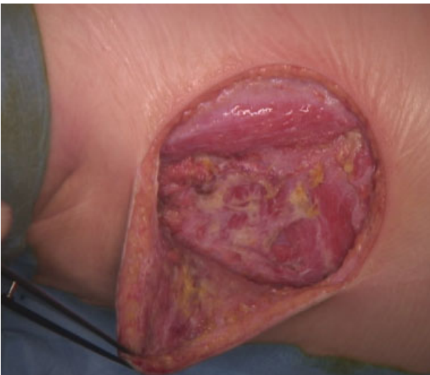
Fig. 2 Intraoperative site after incision.

NF is a rapidly progressing and potentially life-threatening infection of the superficial fascia and subcutaneous tissue. Early diagnosis is essential because immediate surgical debridement offers the best chance for survival. It has been reported that delay of surgical intervention by more than 24 hours doubles mortality. 3 Initial symptoms are nonspecific: the most frequently reported signs are fever, tenderness, erythema, and pain. 2 Since the underlying tissue is affected more extensively than the dermal or epidermal layer, edema may extend the erythematous border. The often fulminant progression of skin findings occurs within hours and erythema progresses to violaceous necrotic lesions, vesicles, and bullae if untreated. 3