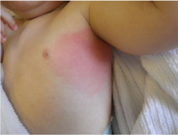
Fig. 1 Initial clinical demonstration leading to the diagnosis.