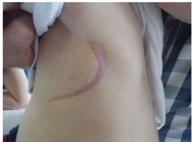
Fig. 4 Clinical presentation after 2 months.