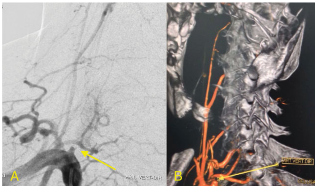
Fig. 1 (A) Initial angiography showing right vertebral artery dissection (yellow arrow). (B) Angiography reconstruction showing right vertebral artery dissection (yellow arrow).

events for a cervical pain that was extremely manipulated by this professional with strong lateral torsion.