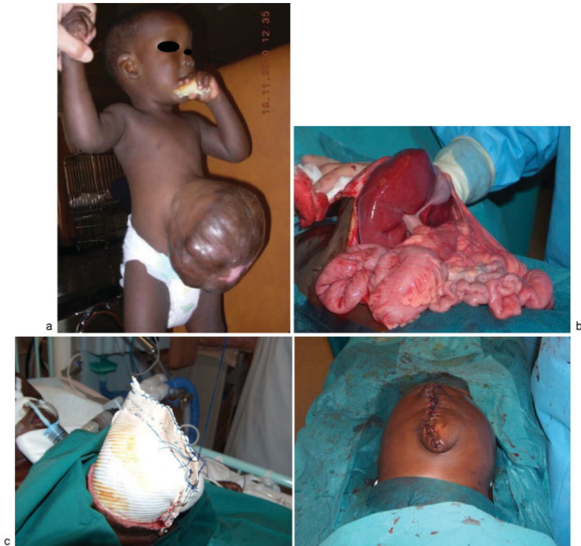
Fig. 1 Steps of ventral hernia correction in patient 5. (A) Preoperative aspects of giant omphalocele (GO). (B) Peroperative aspect: GO content and GO closure using the Schuster technique. (C) Gradual plication and final closure of ventral hernia.

This case series shows that conservative management of GO at birth in West Africa without neonatal intensive care and delayed closure of the ventral hernia in a European center turned out to be safe.