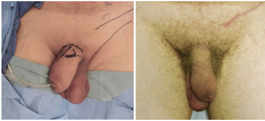
Fig. 3 A left-pedicled superficial inguinal lymph node flap for penoscrotal lymphedema. Left: A 27-year-old man with idiopathic penoscrotal lymphedema. Intraoperative lymphangiography showed some evidence of residual lymphatic vessels; however, the lymphaticovenular anastomosis was attempted but not successful due to extensive subcutaneous fibrosis. Right: At 5-month follow-up, the patient reported improvement in the feeling of heaviness of the penis and scrotum. Also, the penis was softer to palpation and demonstrated a reduced circumference especially at the base.

lymphadenectomy and radiation therapy. In patients with penoscrotal lymphedema, “lymphangioplasty” techniques have been performed historically with questionable benefit, 19 although recently some authors report more promising results with LVA. 20 Therefore, in this clinical setting, we believe that LVA should also be performed in conjunction with VLNT whenever possible. However, it is important to note that longstanding lymphedema commonly results in chronic inflammation that causes considerable soft tissue fibrosis that can often make LVA unfeasible in penoscrotal disease (→Fig. 3). In three of our cases of penoscrotal lymphedema, LVA was attempted, but no suitable lymphatic channels were found in the subcutaneous tissues of the penis or scrotum.