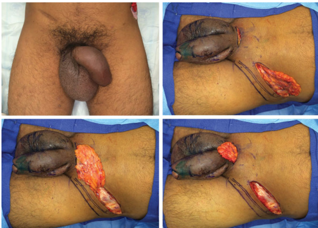
Fig. 1 A left-pedicled superficial inguinal lymph node flap for penoscrotal lymphedema. Above, left: A 34-year-old male patient with longstanding idiopathic penoscrotal lymphedema resulting in functional difficulties. Above, right: An incision is made in the lower abdomen. Note the marked groin crease and the position of the inguinal ligament (double lines). A flap consisting of adipofascial tissue containing the superficial inguinal lymph nodes is harvested. It is important not to carry the dissection inferior to the groin crease to avoid disruption to the lymph nodes that drain the lower extremity. Note that indocyanine green has been injected into the skin of the penis to facilitate intraoperative lymphangiography. Below, left: The flap is primarily based on the superficial circumflex iliac vessels and can easily reach the base of the penis and scrotum. Below, right: Flap inset at the base of the penis and scrotum.

Postoperatively, patients were instructed to continue their existing nonsurgical therapy for lymphedema, such as elevation and the use of compression garments. Patients presented for follow-up at 1 week and subsequently at approximately 3-month intervals to evaluate the status of