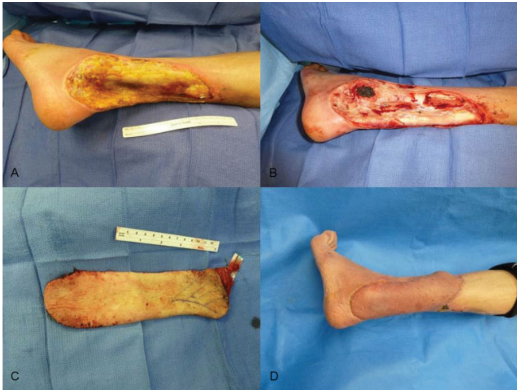
Fig. 1 (A) Defect before initial debridement; (B) defect after initial debridement; (C) parascapular flap; (D) final soft tissue coverage.

3B fracture with exposed hardware. Upon transfer to the University of Utah, she had a large wound with exposed, denuded tibia, exposed fracture line, and exposed hardware (► Fig. 2A ). She initially underwent surgical debridement,