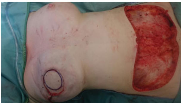
Fig. 3 Stacked superior flap as skin paddle.

The bilateral stacked SIEA flap offers the benefits of a completely autologous reconstruction. The flap harvest is more efficient than that of a deep inferior epigastric artery (DIEA) or PAP flap. There is no secondary wound and no breach in the rectus sheath/muscle reducing the risk of hernia and pain markedly. It provides an equivocal aesthetic outcome seen with other options for stacked autologous reconstruction.