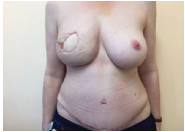
Fig. 4 Postoperative result in outpatients at 6 weeks.

There are two large series of stacked autologous breast tissue reconstructions, the first had a mean operative time of greater than 10 hours 8 and Allen et al was 7 hours and 20 minutes. 3 In our case procedure time was 7 hours and 30 minutes.