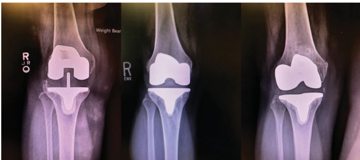
Fig. 1 Anteroposterior radiographs prior to revision surgery.

Radiographic evaluation of the 15 knees that received this implant demonstrated only 2 (13%) to have evidence of radiolucencies. In the first case, on the AP radiograph, there was evidence of radiolucency in zones 1 and 2. On the lateral radiograph, there was evidence of radiolucency in zone 3A. For the second case, there was evidence of radiolucencies in zones 1, 2, and 3L on AP radiograph, and zones 1, 2, and 3A on lateral view (→ Fig. 1).