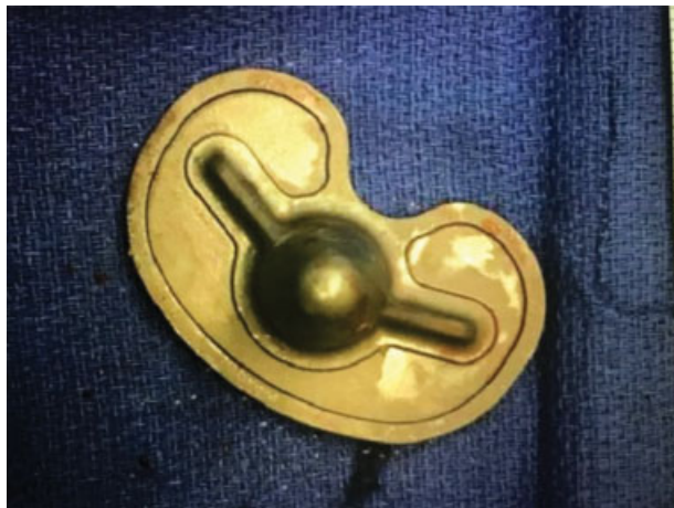
Fig. 2 Inferior surface of the tibial component immediately after explantation.

In all revision cases described in this study, there was an apparent loosening of the tibial component with gross implant motion between the tibial tray and tibial bone cement. In one patient, the tibial tray would piston 4 mm as the knee was brought from flexion to extension, and would lift off from the tibial bone cement when the leg was manually distracted intraoperatively. All patients underwent revision of both tibial and femoral components. In all tibial cases, the tibial component had debonded and was easily separated from the cement mantle. Upon removal of the tibial baseplate, the inferior surface of the tibial baseplate was clear of cement (→ Fig. 2), while all the cement was strongly adherent to the tibial bone (→ Fig. 3). The femoral components were securely attached to the femoral bone with no apparent loosening. Upon explantation of the femoral components, the cement was strongly adherent to the implant surface in all cases (→ Fig. 4).