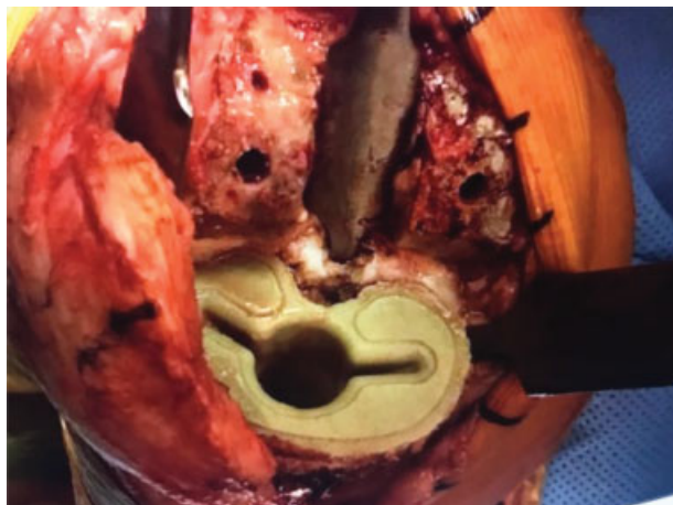
Fig. 3 Cement adherent to the tibial bone after explantation of tibial component.