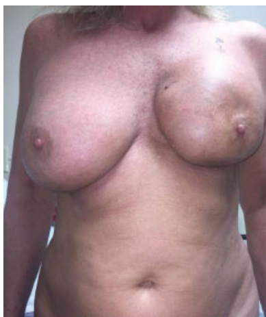
Fig. 1 The patient was evaluated preoperatively and found to have left breast Baker grade 3 capsular contracture with cephalic migration of the implant.