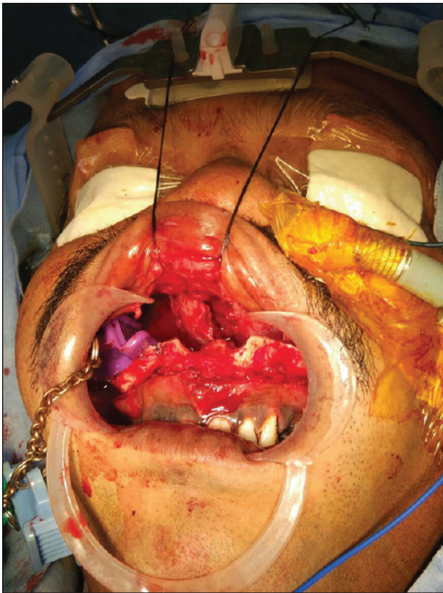
Fig. 2 Before exchange of the tube with Le fort 2 exposure.