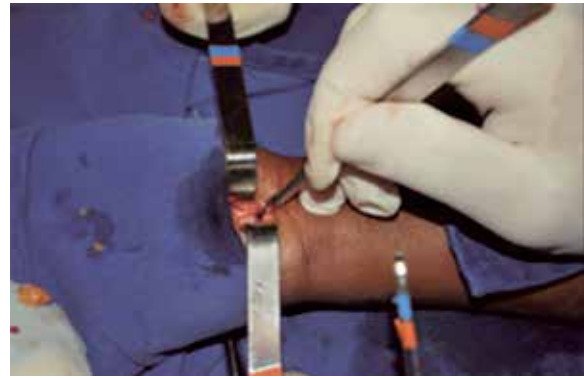
Figure 1 – Incision of the released flexor retinaculum.