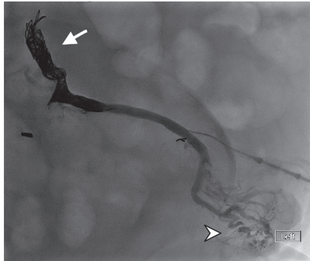
Fig. 3 After coil embolization (arrows), Gelfoam slurry was then injected, which flowed to the peristomal varices (arrowhead).

below at its confluence with the splenic vein demonstrated retrograde flow toward the left lower quadrant stoma opacifying peristomal collaterals. Embolization was then performed using microcoils (► Fig. 3 , arrow), across a channel of tangle of collateral vessels; Gelfoam slurry was then injected in the