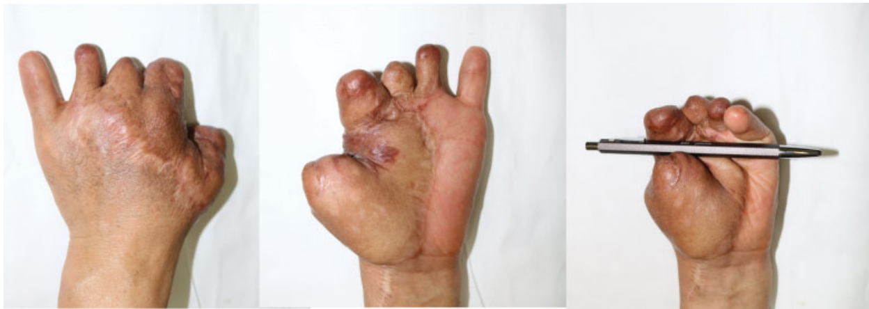
Fig. 3 Postoperative images at 1-year follow-up. The flap survived well and multiple minor operations for division were completed. The patient could get preservation of thumb grasping function with satisfactory power.