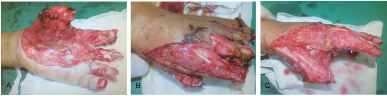
Fig. 1 Preoperative images of the patient who was involved in a rolling machine accident resulting in a degloving injury of volar and dorsal side on his left hand that combined with multiple digit amputations. (A) Volar, (B) dorsal, and (C) radial sides.