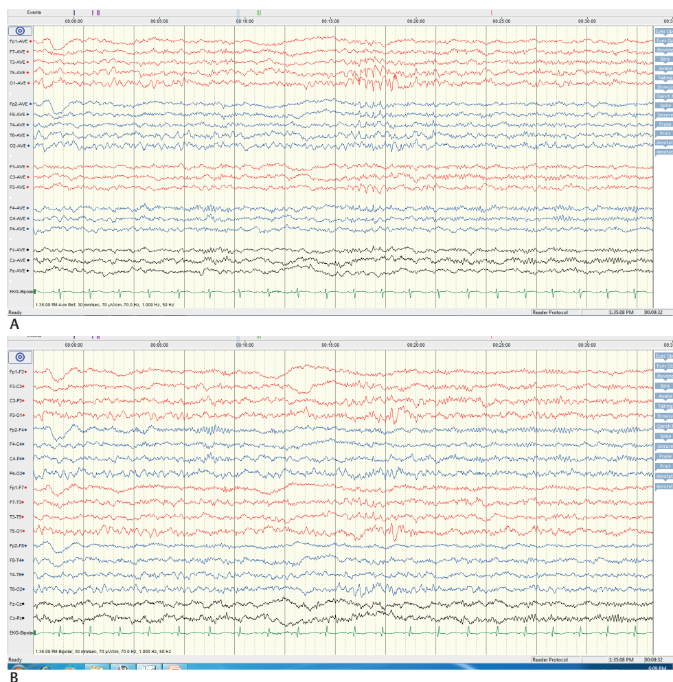
Fig. 1 (A) Average referential montage in a young child during light sleep showing 6 Hz positive spikes. (B) Longitudinal bipolar montage of the same discharge.

Six and 14 Hz positive spikes usually appear in stages of drowsiness and light sleep; however, sometimes they can be seen in rapid eye movement sleep also. 17 The pattern is usually small in amplitude and best seen in a referential montage (► Fig. 1A) and may not be clearly visible in the bipolar montage (► Fig. 1B). It usually appears asynchronously or independently over both the hemisphere. Sometimes, it is seen synchronously on both the sides. It may have a predilection for one hemisphere, which may change over time from one hemisphere to another hemisphere in the