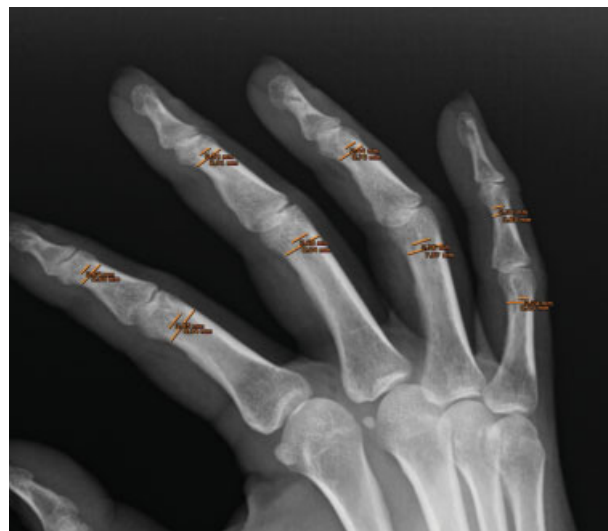
Fig. 2 Measurement of the proximal and medial phalanges of the large fingers in an oblique radiograph using IRE Image Channel software (IRE Rayos X S.A., Madrid, Spain).