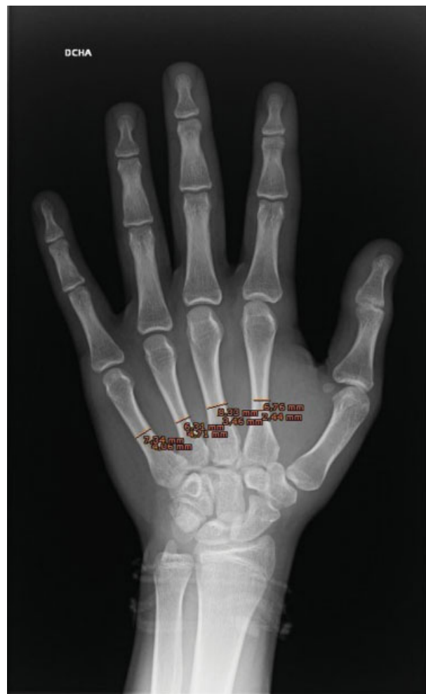
Fig. 1 Measurement of the metacarpals of the large fingers on PA radiograph using IRE Image Channel software (IRE Rayos X S.A., Madrid, Spain).

On analyzing the measurements obtained, we found the following results.