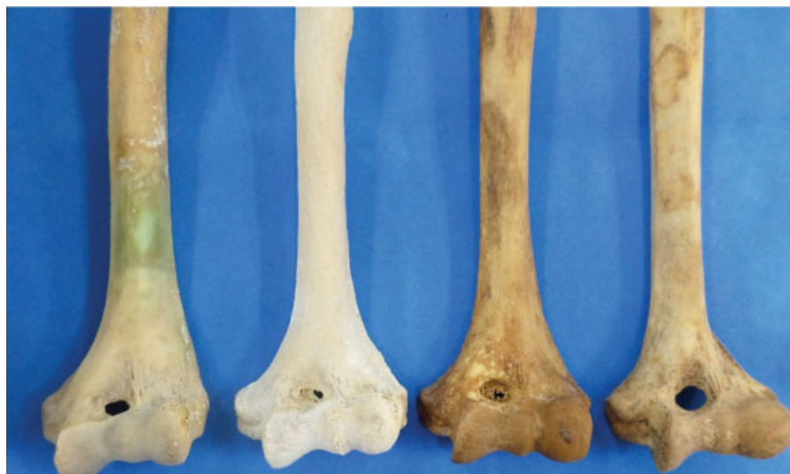
Fig. 1 Different shapes of the supratrochlear foramina (right to left): oval, irregular, cribriform and round.

SF is a phylogenetic feature, also found in primates, and which can be inhibited by a more robust member. Explaining the higher frequency of SF on the left side observed in our study. This fact is due the intermittent pressure in the region resulting in hyperemia and strengthening of the bone septum, 15 which occurs on the right side in right-handed individuals, generating a more robust member compared with the left one.