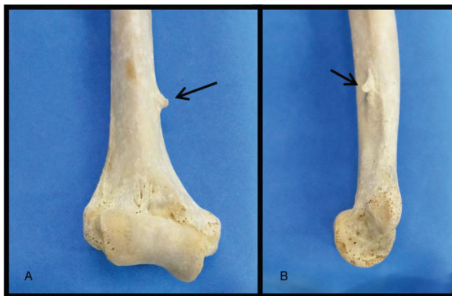
Fig. 3 Humerus with the presence of the supracondylar process (arrows). Anterior view (A) and medial view (B).

According to Paraskevas et al. (2012), 16 there is an association between SF and presence of the supracondylar process, however, in this study, only one humerus was identified with the presence of the supracondylar process, not associated with SF (► Fig. 3 ).