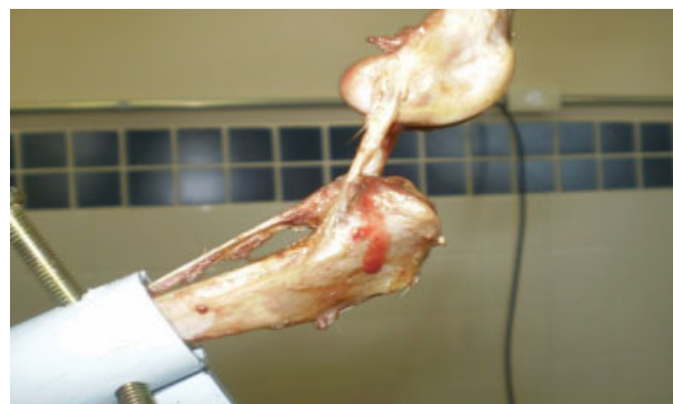
Fig. 1 Photograph showing the collateral ligaments of the left femorotibial joint (arrows) - Petrolina, 2016.

Then, with the aid of a band saw, the distal third of the femur was fractured, as well as the proximal third of the tibia and fibula, suspended only through the collateral ligaments.