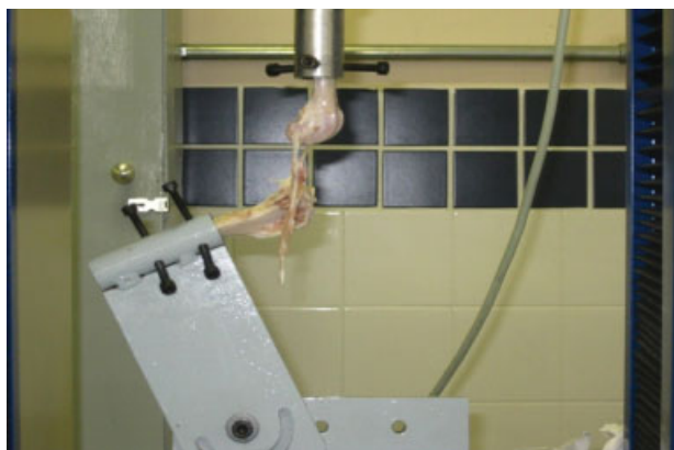
Fig. 6 Torn medial collateral ligament (arrow) - Petrolina, 2016.

The size of most of the ligaments of the body is associated with the body size. We could not see such relation between the development of the collateral ligaments of the femorotibial joint and the mass or the size of the body.