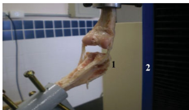
Fig. 3 Photograph showing the medial (1) and lateral (2) collateral ligaments of the femorotibial joint of a not - defined dog submitted to a destructive mechanical test - Petrolina, 2016.

both body biometric data and data on the collateral ligaments of the femorotibial joint, respectively. It is important to highlight that the statistical treatment was very detailed, to establish correlations between the body biometry and the biometry of the collateral ligaments of the femorotibial joint, as well as to elucidate differences inherent to the contralateral ligaments. The graph above displays the correlations between the collateral ligaments of the femorotibial joint. Data were obtained from the SAS 9.2 help program and the Satterthwaite test, considering a significance level ( r ) greater than 0.7: