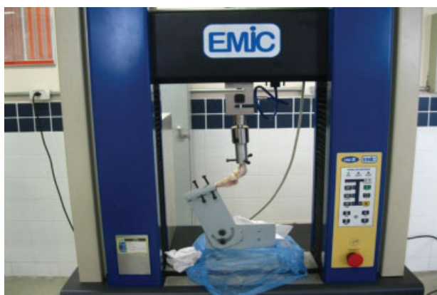
Fig. 2 Photograph showing the articulation (arrow) fixed to the Universal Machine of Electromechanical and Micro processed Tests (Digital Line, EMIC) - Petrolina, 2016.