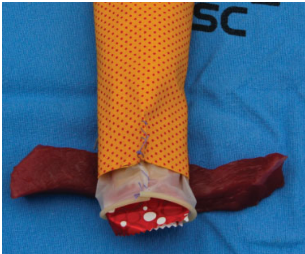
Fig. 3 Representation of the rectal mucosa and the internal anal sphincter sutured with a simple continuous suture.