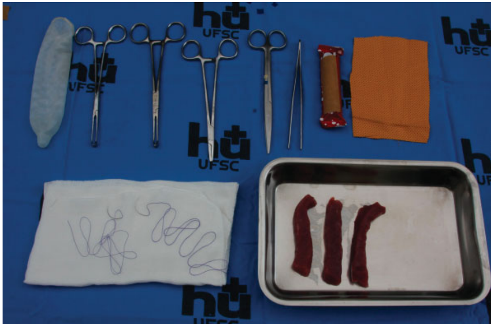
Fig. 1 Material used for simulator assembly and simulated laceration repair - Chocolate bar, condom, 15 cm × 10 cm cotton cloth flap, beef strips ~ 1 cm × 1 cm × 8 cm, surgical material (tweezers, needle holder, scissors, Allis clamp) and suture.

cotton cloth flap; beef strips of ~ 1 cm × 1 cm × 8 cm; surgical material (tweezers, needle holder, scissors, Allis clamp) and suture (► Fig. 1 ). The beef was fat-free and had the longest fibers running longitudinally to simulate the sphincter fibers.