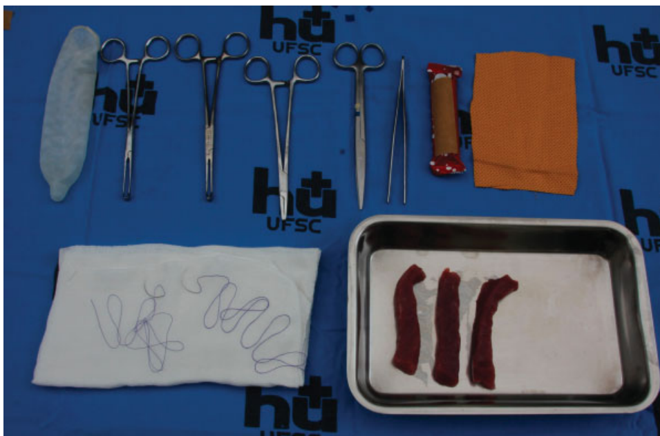
Fig. 1 Material used for simulator assembly and simulated laceration repair - Chocolate bar, condom, 15 cm × 10 cm cotton cloth flap, beef strips ~ 1 cm × 1 cm × 8 cm, surgical material (tweezers, needle holder, scissors, Allis clamp) and suture.

cotton cloth flap; beef strips of ~ 1 cm × 1 cm × 8 cm; surgical material (tweezers, needle holder, scissors, Allis clamp) and suture (►Fig. 1). The beef was fat-free and had the longest fibers running longitudinally to simulate the sphincter fibers.