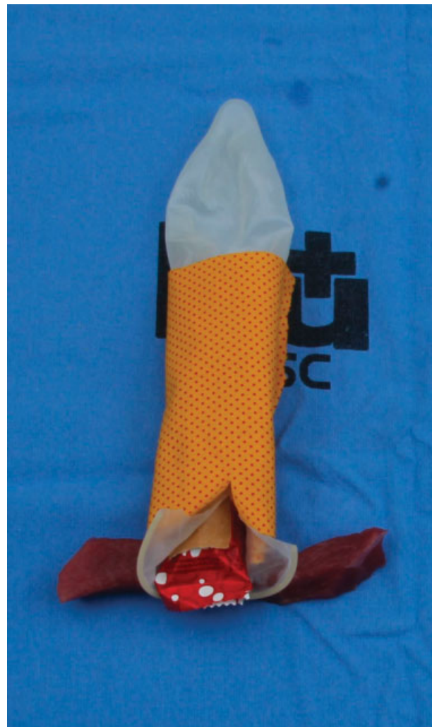
Fig. 2 Representation of the severe perineal laceration in the simulator.

The practical aspects of diagnosing and suturing severe lacerations include the need to evaluate the sphincter and the rectal mucosa after the delivery, adequate anesthesia, positioning of the patient, illumination, a good surgical field, and antisepsis. 23-25 The most appropriate wires for each anatomical layer were presented. The torn anal mucosa is repaired using a continuous (nonlocking) 3-0 or 4-0 braided polyglactin on a tapered needle; a monofilament suture such as poliglecaprone 25 is also acceptable. The internal anal sphincter should be properly identified and repaired as a separate layer (► Fig. 3 ) using a continuous 3-0 polyglactin suture or a 3-0 monofilament synthetic suture (for example, poliglecaprone 25) on a tapered needle. 24,25 The external anal sphincter was sutured with end-to-end techniques or overlapping plication (► Fig. 4 ) using interrupted or figure-of-eight sutures; 2-0 or 3-0 polydioxanone or 2-0 polyglactin suture on a tapered needle. 24,25 In the simulation, to reduce costs, yarns that were past due or cheaper, such as catgut, were used.