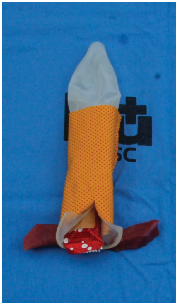
Fig. 2 Representation of the severe perineal laceration in the simulator.

The practical aspects of diagnosing and suturing severe lacerations include the need to evaluate the sphincter and the rectal mucosa after the delivery, adequate anesthesia, positioning of the patient, illumination, a good surgical field, and antisepsis. 23-25 The most appropriate wires for each anatomical layer were presented. The torn anal mucosa is repaired using a continuous (nonlocking) 3-0 or 4-0 braided polyglactin on a tapered needle; a monofilament suture such as poliglecaprone 25 is also acceptable. The internal anal sphincter should be properly identified and repaired as a separate layer (►Fig. 3) using a continuous 3-0 polyglactin suture or a 3-0 monofilament synthetic suture (for example, poliglecaprone 25) on a tapered needle. 24,25 The external anal sphincter was sutured with end-to-end techniques or overlapping plication (►Fig. 4) using interrupted or figure-of-eight sutures; 2-0 or 3-0 polydioxanone or 2-0 polyglactin suture on a tapered needle. 24,25 In the simulation, to reduce costs, yarns that were past due or cheaper, such as catgut, were used.