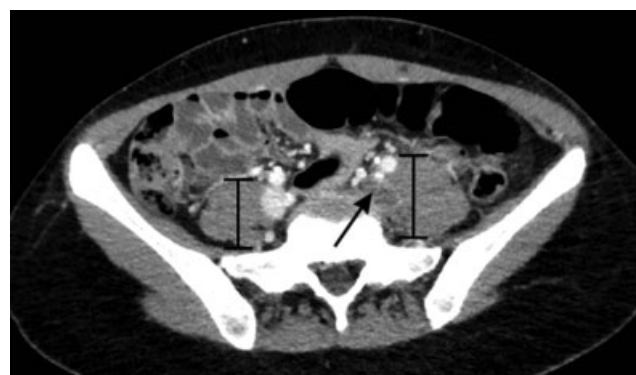
Fig. 1 Postcontrast axial view of CT of abdomen/pelvis demonstrating a clot within the left common iliac vein (arrow) and the comparative increased size of the underlying psoas muscle (brackets).

Follow-up ultrasound 10 months later showed patent stent and no residual thrombus. The presence of hypercoagulable states in the setting of endovenous stents is associated with