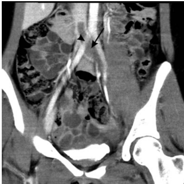
Fig. 2 Postcontrast sagittal view of CT of abdomen/pelvis demonstrating thrombus within left common iliac vein ( arrow ) extending into inferior vena cava. This view also demonstrates the compression of the left common iliac vein by the overlying right common iliac artery ( arrow head ).

higher rates of secondary loss of stent patency and stent thrombosis. This is observed in few anecdotal case reports 6 suggesting that this is an area that would benefit from further research.