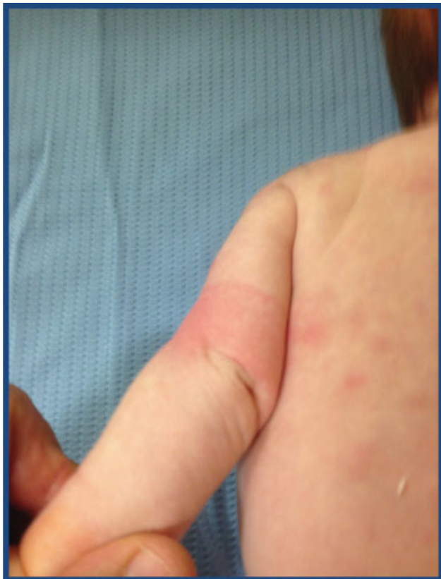
Fig. 3 Subcutaneous fat necrosis on the left arm of the same infant.