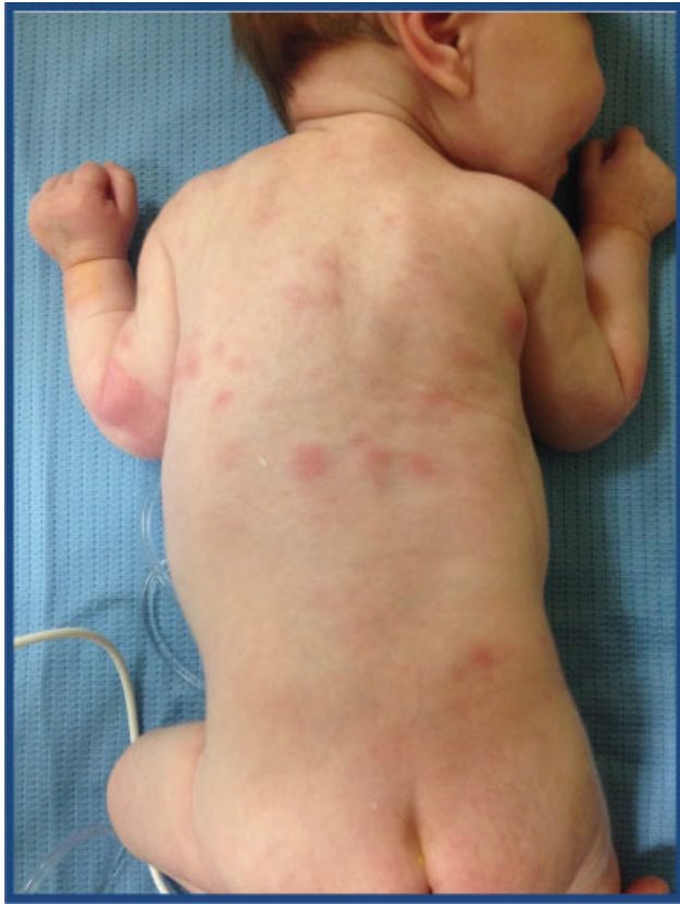
Fig. 2 A 3-week-old infant with lesions of subcutaneous fat necrosis located on the left arm, back, and cheeks.