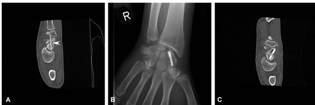
Fig. 1 Preoperative computed tomography (CT) showing a mild humpback deformity and an intrascaphoid angle of 44° (white lines) and the occurrence of the bony cyst > 5 mm (white arrow; A). Radiographs taken 7 weeks postoperatively showing uncertain signs of healing; the patients had persistent pain (B). CT image obtained at 10 weeks postoperatively shows union (C).

Arthroscopically assisted treatment of scaphoid nonunion has garnered considerable interest among hand surgeons since 2006, when the original technique was introduced. 23 Slade and Gillon 24 have retrospectively investigated 108 scaphoid nonunion patients for a mean of 20 months from