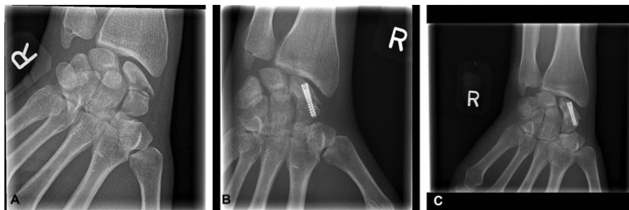
Fig. 2 A 32-year-old man had a 15-year-old nonunion with moderate symptoms until a recent fall from a bike, resulting in comminuted fracture of the waist of the same scaphoid (A). He was treated using local grafting and arthroscopically assisted technique; union was achieved both at the nonunion and fracture sites at 6 weeks (B). Status at 1-year follow-up (C).

Operation time was significantly higher in the arthroscopic group than in the percutaneous group probably due to the learning curve of this technically more advanced method. Shorter time to union indicates faster return to work and daily routine in this active, young, working patient population,