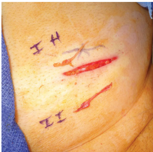
Fig. 2 Abdominal wall of patient demonstrating incision medial to the anterior iliac crest, with the excised iliohypogastric (IH) and ilioinguinal (II) nerves lying next to the incision.

over the preceding 17 months, cystoscopy was normal, neuropathic medications did not help, and a sacral “interstim” did not give relief. Imaging studies were all normal. His physical examination demonstrated discrete pain over the II and IH region with referred pain to his bladder (► Fig. 3 ). Because he was tender in the right lower quadrant, local nerve block into this area was done, and gave him few hours of relief. A nerve block at T12/L1 gave relief of the urgency and frequency for 6 hours. On November 5, 15, he had the