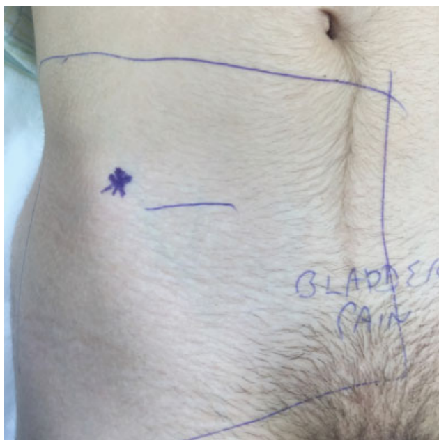
Fig. 3 Case 2, demonstrating asterisk (*) at the site of trigger spot with pain referred to the bladder. The blue line is the border to be prepared for surgery.

over the preceding 17 months, cystoscopy was normal, neuropathic medications did not help, and a sacral “interstim” did not give relief. Imaging studies were all normal. His physical examination demonstrated discrete pain over the II and IH region with referred pain to his bladder (► Fig. 3 ). Because he was tender in the right lower quadrant, local nerve block into this area was done, and gave him few hours of relief. A nerve block at T12/L1 gave relief of the urgency and frequency for 6 hours. On November 5, 15, he had the