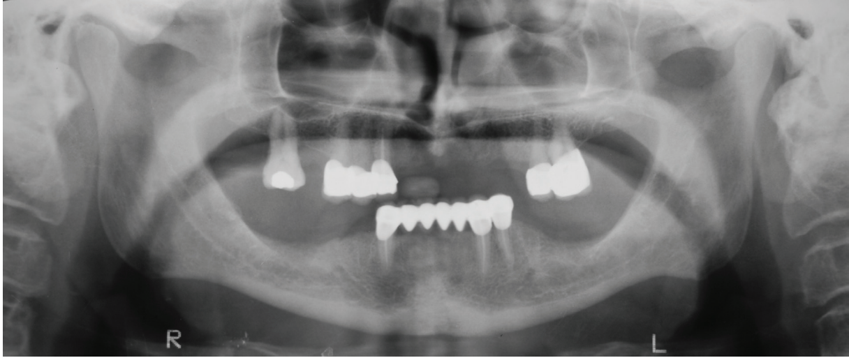
Figure 1. Example of category C1 of the mandibular cortex index.

is clearly porous, severely eroded cortex (Figure 3). The thickness of the mandibular cortex was divided by the distance between the mental foremen and the inferior mandibular cortex to obtain the PMI. 15