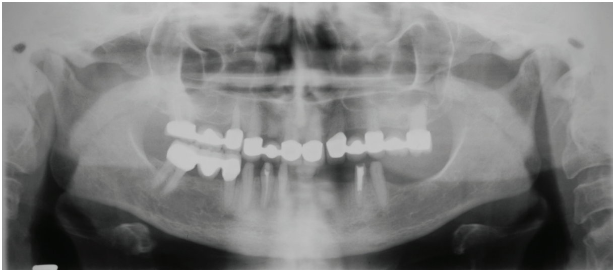
Figure 2. Example of category C2 of the mandibular cortex index.