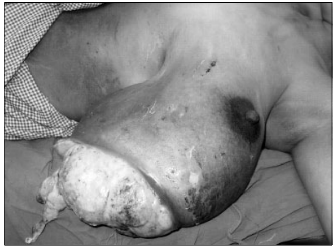
Figure 1: Photograph of the patient in the supine position demonstrating the huge size, the large size of the ulcer and the tumour tissue which is seen sloughing off.