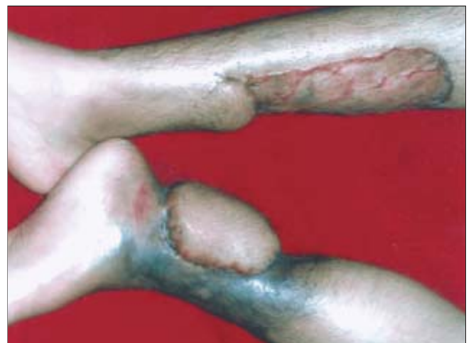
Figure 3b: Follow up results