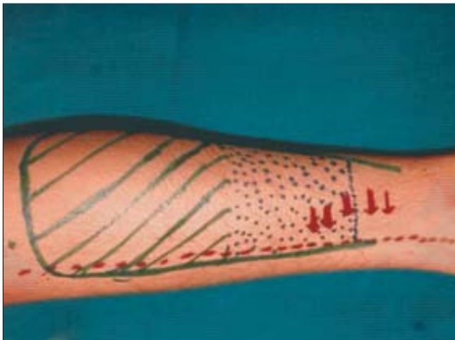
Figure 1a: Planning of cross leg flap on the contralateral limb showing position of perforators, bridge segment and effective flap for reconstruction

avoiding cross legging with minimal discomfort and inconvenience to the patient. Delay and division of the