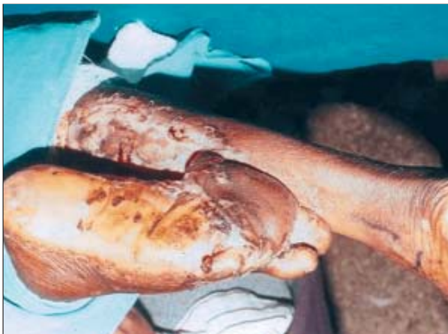
Figure 1b: Planning of cross leg flap on the contralateral limb showing position of perforators, bridge segment and effective flap for reconstruction