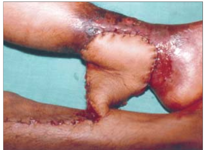
Figure 2: Cross leg flaps for resurfacing (Figure 2a) distal sole, (Figure 2b) post irradiated scar of distal leg