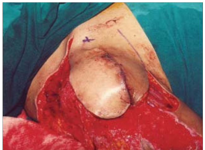
Figure 4: The two arms of the fork flap are sutured together to form a single flap