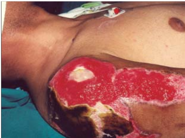
Figure 1: Deep burn right shoulder with exposed joint capsule and biceps tendon

revealed a well-defined arterio-venous pedicle coursing the center of the flap corresponding the Doppler signal [Figure 3]. The inferior arm of the flap was marked along the medial aspect of the anterior shoulder region based on the perforators of the same vessels and possibly with an augmented supply from the deltoid branch of the thoraco-acromial axis [Figure 3]. The flaps were dissected from the distal to the proximal towards the base and found to be of adequate size to cover the desired area. Both flaps were sutured along the inner border and a few deep sutures were applied to fix the flaps [Figure 4]. The remaining raw areas along with the secondary defects were covered by split skin graft. His postoperative period was uneventful and the flaps survival and graft take was full, with primary wound healing [Figure 5]. The physiotherapy for the shoulder movements was started ten days postoperatively and he regained full range of