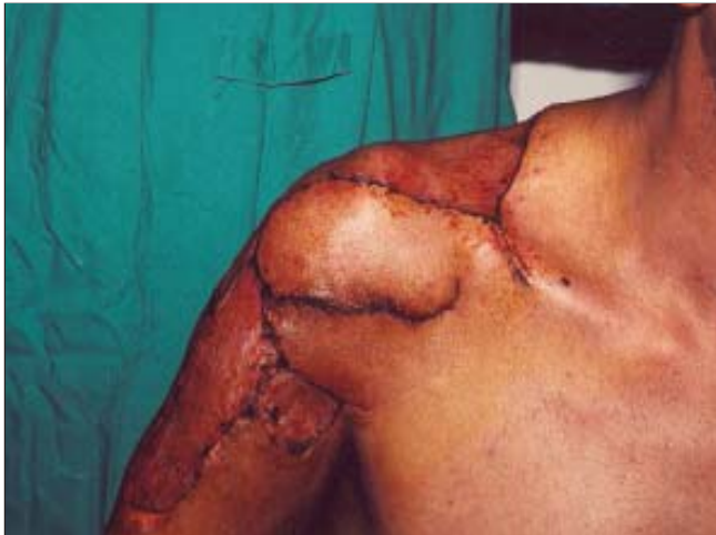
Figure 5: The exposed joint and tendon covered with flap and the remaining area skin grafted shown after healing

The options to cover a defect of this kind would have been to use either a distant flap or a free flap. The forked flap as described covered the exposed joint capsule and biceps tendon successfully and the remainder area was skin grafted including both secondary defects, which merged smoothly with the burnt area. The supraclavicular artery flap has been reported for head and neck reconstruction following tumor surgery or for the post burn contracture release, but the English literature review did not reveal use of it as reported here.