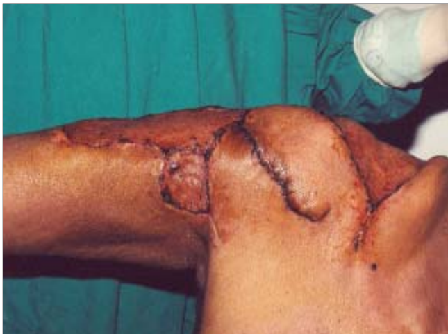
Figure 6: The shoulder movements regained within ten days after healing

In 1979, Lamberty 1 was the first to describe the axial pattern of the shoulder flap based on the Supraclavicular artery. Pallua et al 2 used this flap as an island flap for releasing post burn mentosternal contractures. They subsequently reported the vascular study on 19 cadaver dissections and dye injections. 3 Their findings showed the territory of this flap in the neck and the shoulder.