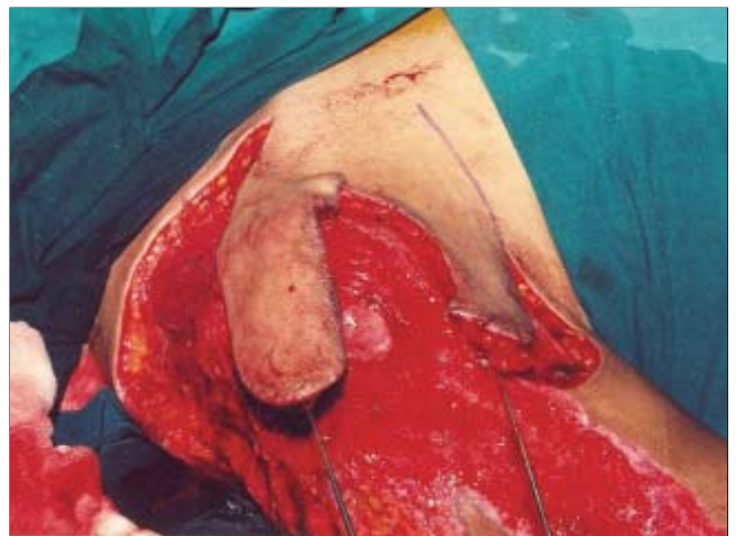
Figure 3: The burn area after debridement showing the exposed joint and tendon and two arms of the fork flap dissected