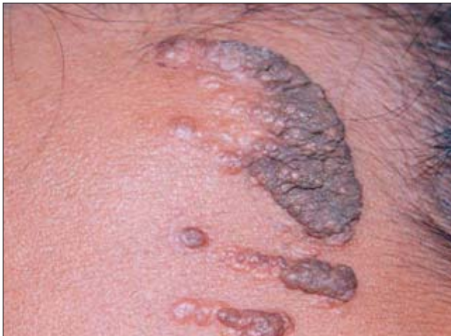
Figure 1: Pre-operative photographs

Nevus Sebaceous of Jadassohn is a hamartoma arising from the sebaceous glands. Tumors both benign and malignant have been reported to arise from the Sebaceous Nevus, some of the commoner ones being Basal cell