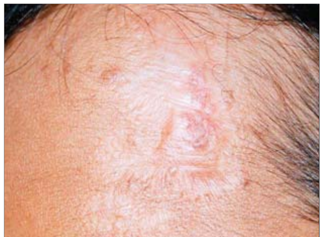
Figure 4: Post-operative, after 6 months