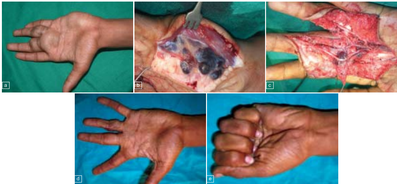
Figure 4: Venous malformation of hand: before (a), during (b, c) and after surgery (d, e)

than fat. A coagulation profile should be done on any child with large a VM as they are at risk for disseminated intravascular coagulopathy (DIC) following trauma or therapeutic intervention.