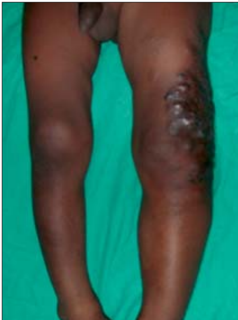
Figure 6: Combined LM, CM, and VM with hypertrophy of limb: Klippel Trenaunay Syndrome

small lesions to extensive AVMs. This is autosomal dominant disorder with the risk of developing benign or malignant neoplasia.