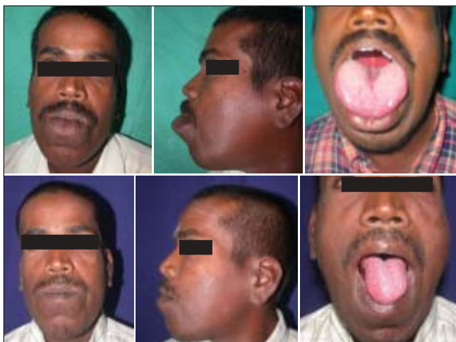
Figure 2: Capillary malformation with overgrowth of lower facial structures. Before (Top) and after reduction (Bottom) of lower lip and tongue. Will need skeletal work.

These are usually present at birth and most are evident before the age of 2 years. However, they can suddenly appear in older child or in adolescence. LM can be classified as microcystic (multiple small cyst less than 2.5 cm) or macrocystic (large cysts >2.5 cm) or combined. They are most commonly located in axilla/chest, cervicofacial, mediastinum, retroperitoneum, buttock and anogenital areas. Apart from presenting as a tumour, LM can manifest as tiny vesicles on the skin. Intralesional bleeding is common and evident as tiny dark-red nodules.