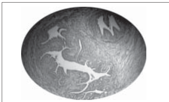
Figure 2: Cysticercosis - Scolex and epithelium lined tortuous body canal continuous with outer cystic layer

Clinical manifestations of intestinal infection by Taenia solium could be asymptomatic or may present with epigastric pain, nausea and loose motions. In cysticercosis manifestations are different and depends on the location of cysticercosis in the body, not only this but also the number of cysticercosis at a particular site and the associated inflammatory response or scarring decides the clinical presentation. In 87% of cases cysticercosis presents as solitary lesion. Presentation as subcutaneous nodule on trunk, upper arm, eyes, neck, tongue, face and breast has been reported in this order of frequency. Neurocysticercosis is most often presented with seizures and may be associated with subcutaneous nodules comprised of extraneural cysts.